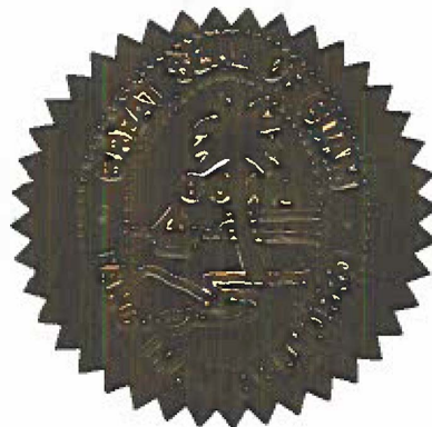
JOSHUA F. TENORIO Sigundo Maga'låhen Guåhan Lt. Governor of Guam

A handwritten signature in black ink that reads "Joshua F. Tenorio".